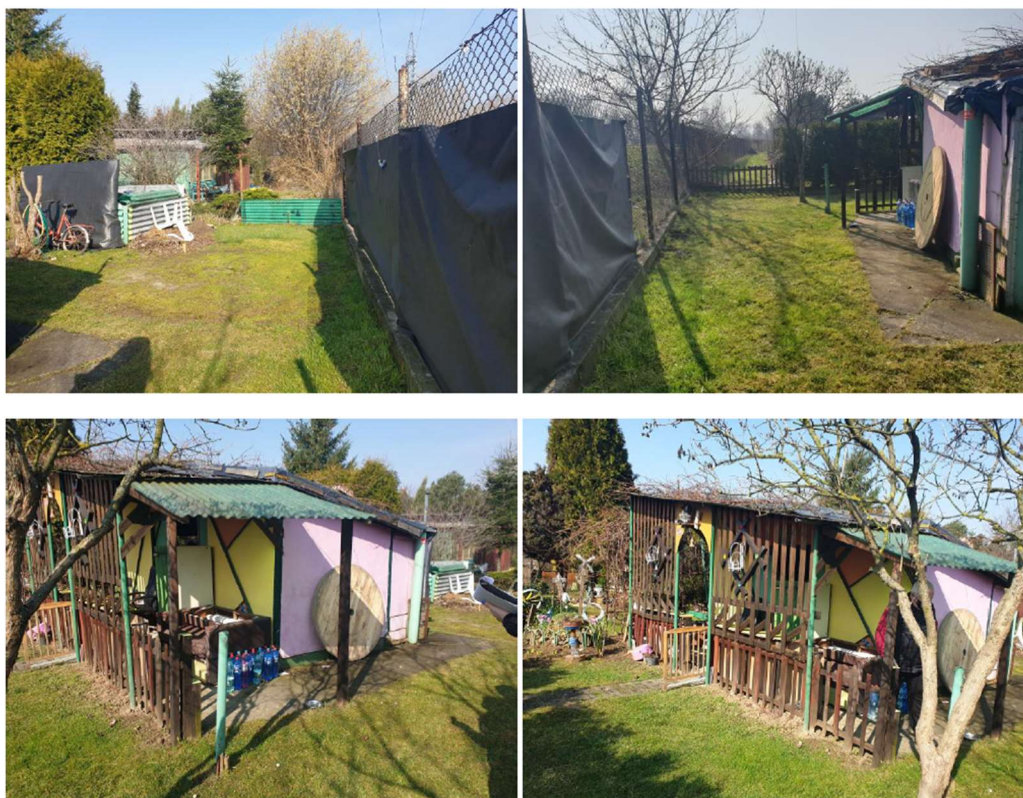
Photo. 7. Condition of the Construction Site before the start of works implementation – allotment gardens on FAG JASKÓŁKA.