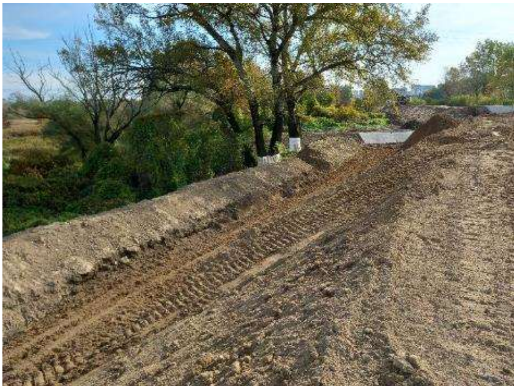
Photo. 10. Right embankment at km approx. 0+500 – covers of single, thick-barked trees by means of boards (3rd decade of October 2021).