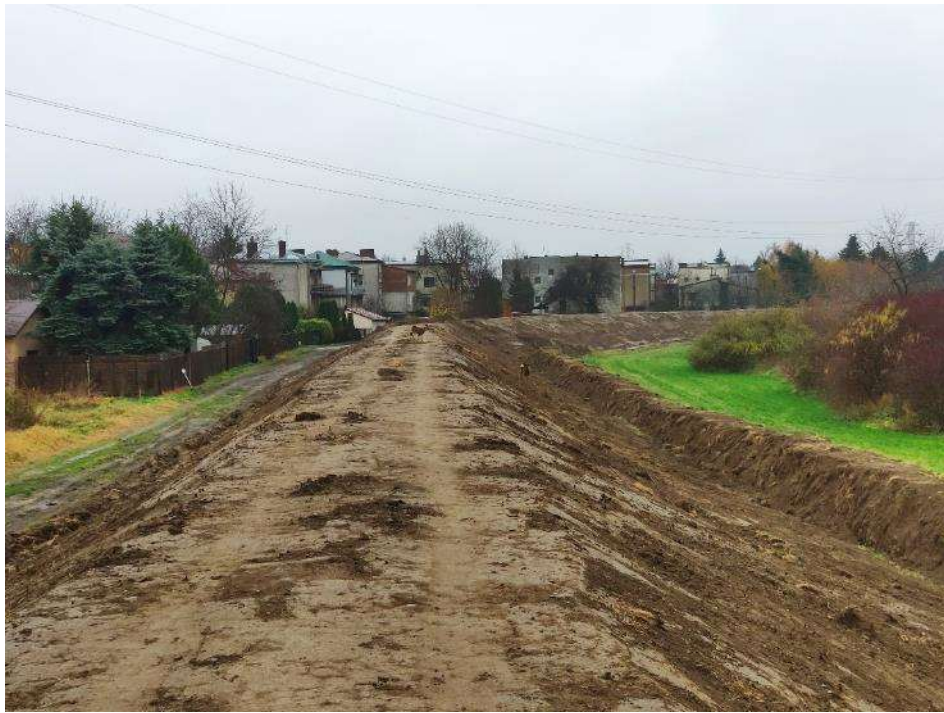
Photo. 11. Right embankment at km approx. 5+600 – the area of the works performed (1st decade of November 2021).