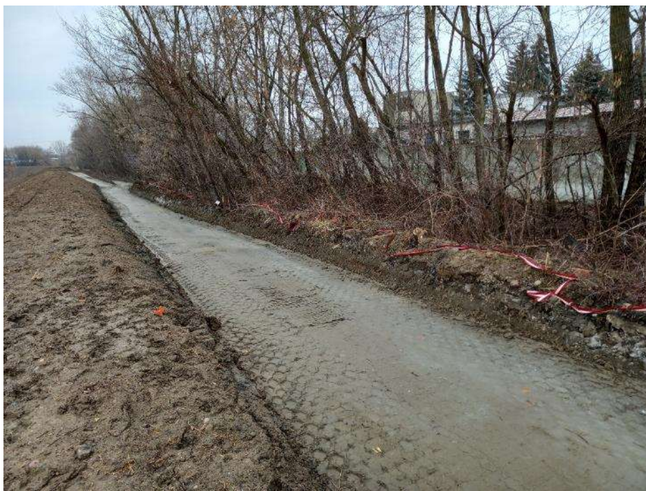
Photo. 16. Right embankment at km approx. 4+500 – works in progress (2nd decade of February 2023).