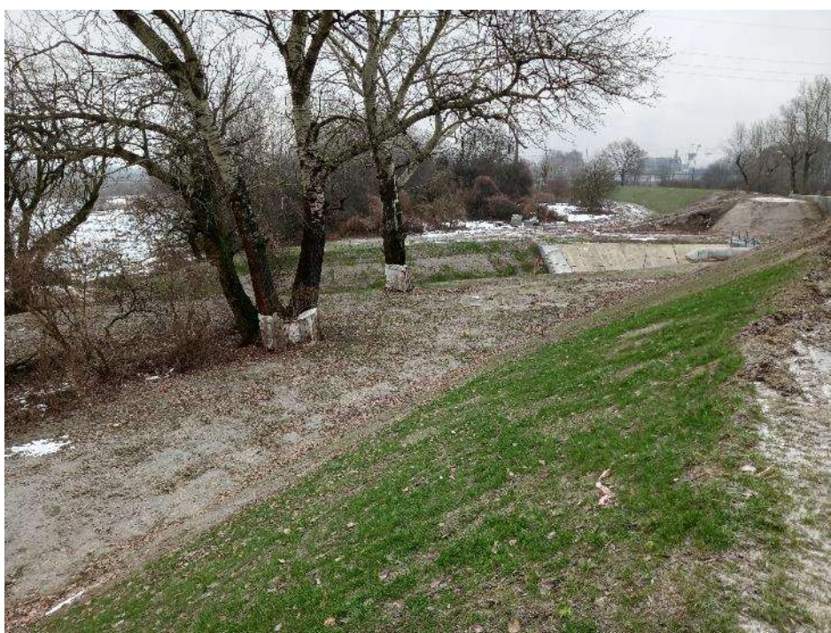
Photo. 14. Left embankment at km approx. 0+400 – securing the greenery bordering the zone of conducted works (3rd decade of January 2023)