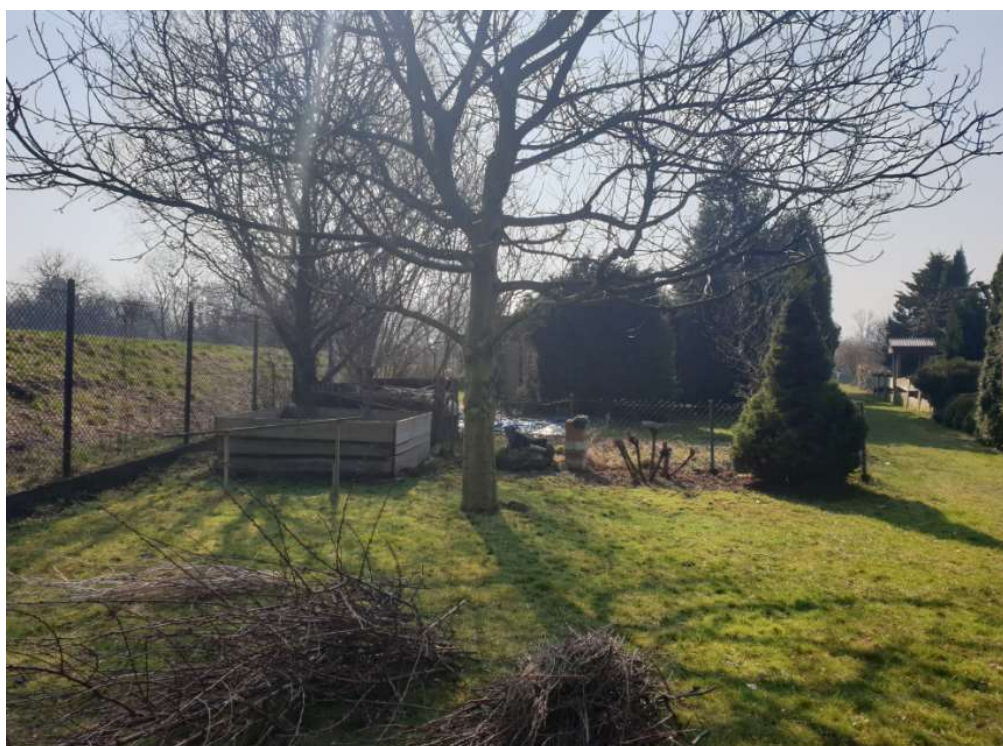
Photo. 6. Condition of the Construction Site before the start of works implementation – allotment gardens on FAG JASKÓŁKA.