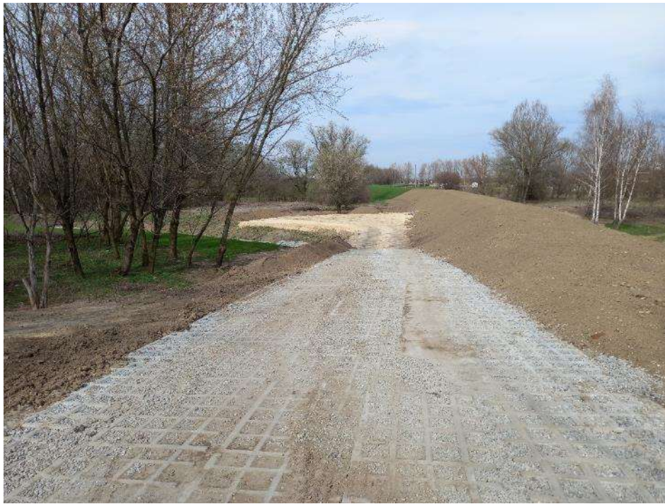
Photo. 18. Right embankment at km approx. 3+150 – reclamation of the site after the completion of works (3rd decade of March 2023).