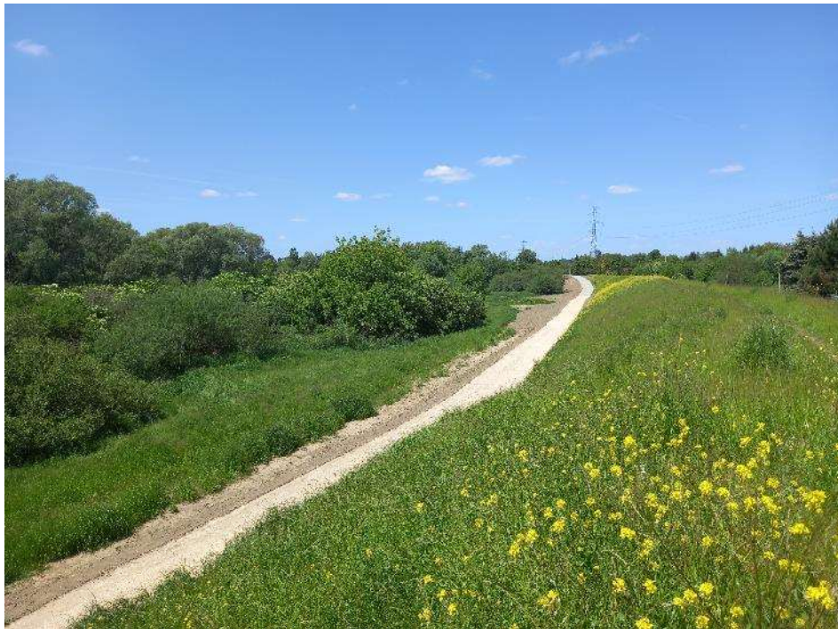
Photo. 23. Right embankment at km approx. 5+700 – site after the completion of works (May 2023).