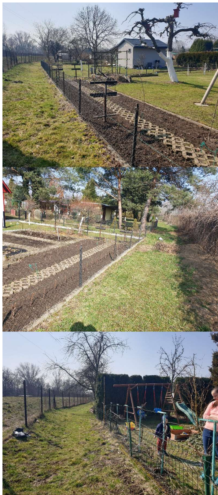
Photo. 8. Condition of the Construction Site before the start of works implementation – allotment gardens on FAG JASKÓŁKA.