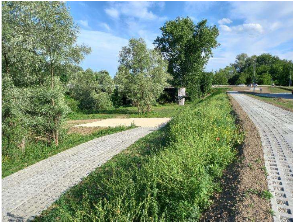
Photo. 24. Left embankment at km approx. 6+000 – site after the completion of works (June 2023).