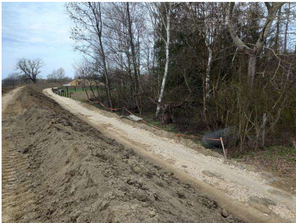
Photo. 19. Right embankment, final section of the embankment – works in progress (3rd decade of March 2023).