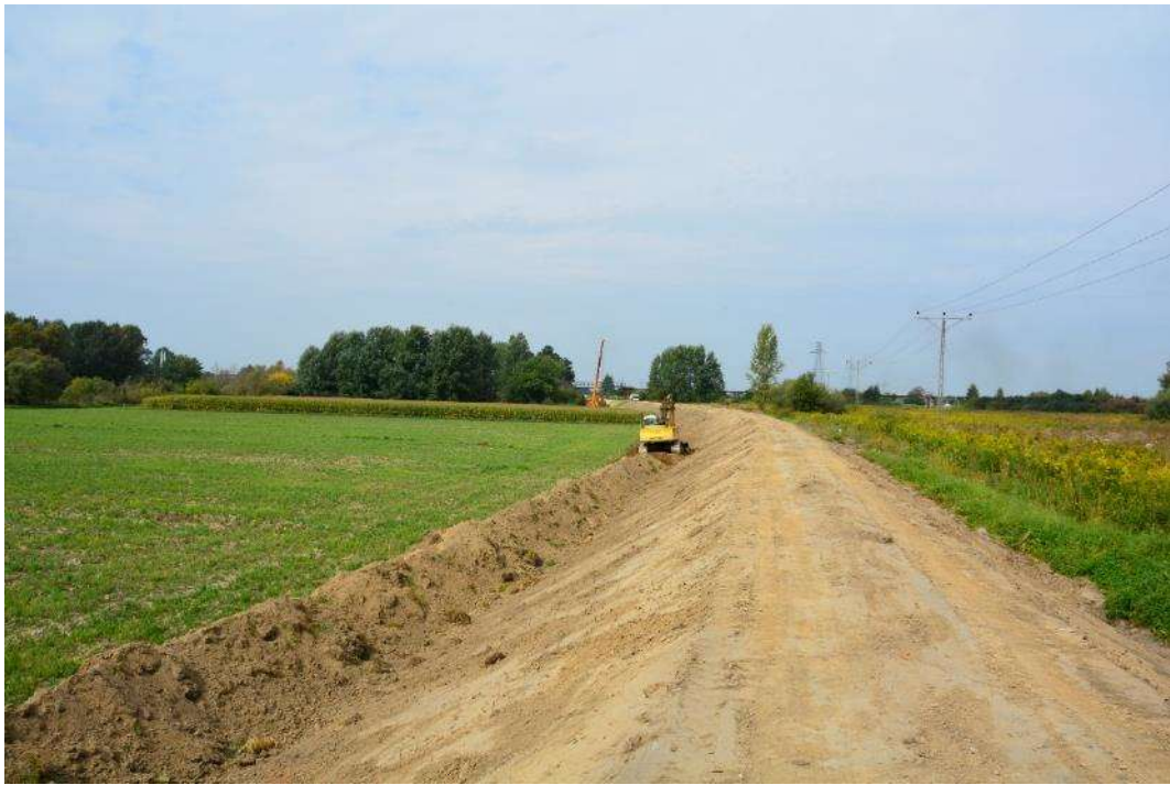
Photo. 9. Right embankment at km approx. 1+200 – topsoil removal of the embankment (September 2021).