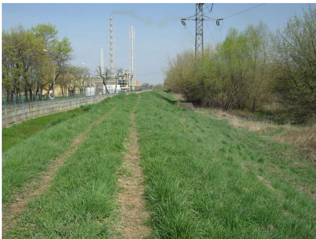
Photo. 2. Condition of the Construction Site before the start of works implementation – left embankment - area beyond the embankment, industrial plants, fence along the embankment.