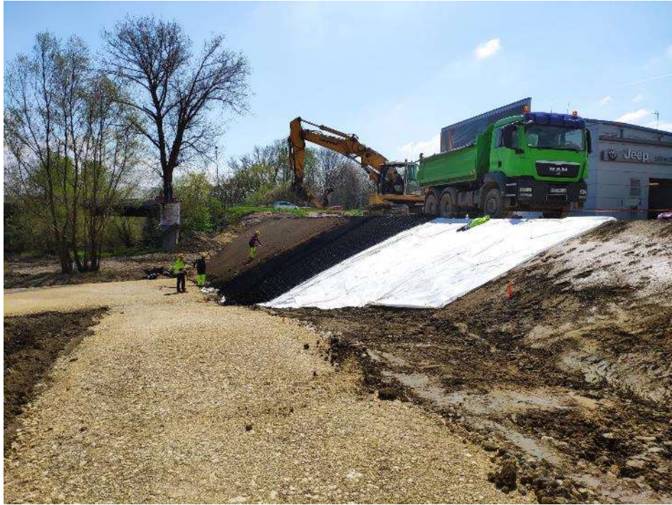
Photo. 20. Left embankment at km approx. 6+000 – topsoiling and reclamation of the embankment (2nd decade of April 2023).