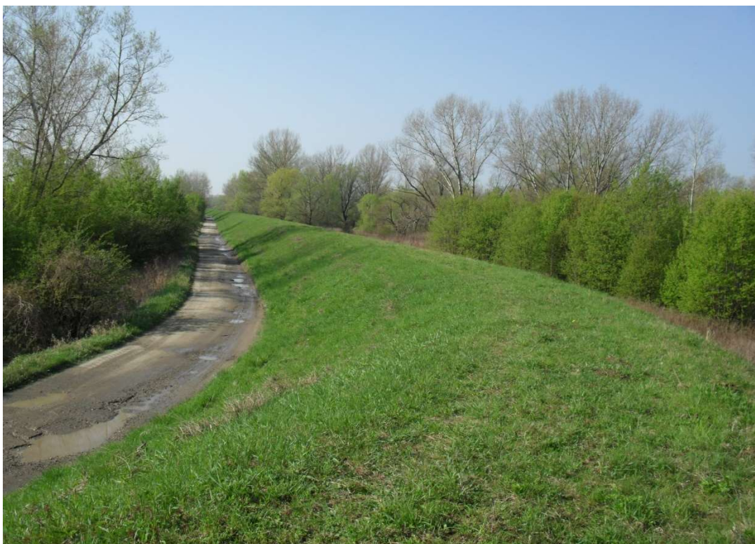
Photo. 1. Condition of the Construction Site before the start of works implementation – left embankment at chainage km 0+000 – view to the embanked area and hardened road.