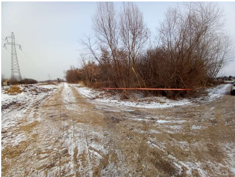
Photo. 12. Right embankment at km approx. 2+100 – the constructed additional greenery fencing at entrance to back-up facilities (3rd decade of December 2021)