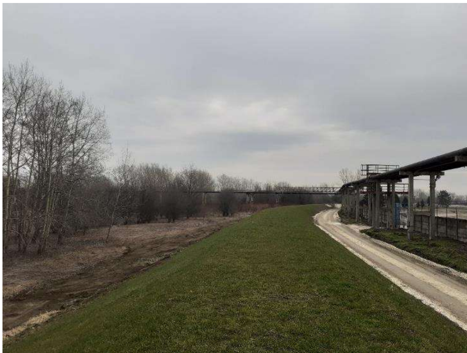
Photo. 15. Left embankment at km approx. 0+600 – grass growth after topsoiling and reclamation of the embankment (2nd decade of February 2023).