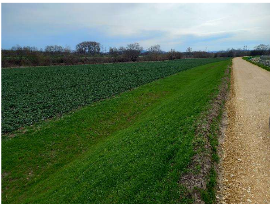
Photo. 17. Left embankment at km approx. 1+300 – grass growth after topsoiling and reclamation of the embankment (3rd decade of March 2023).