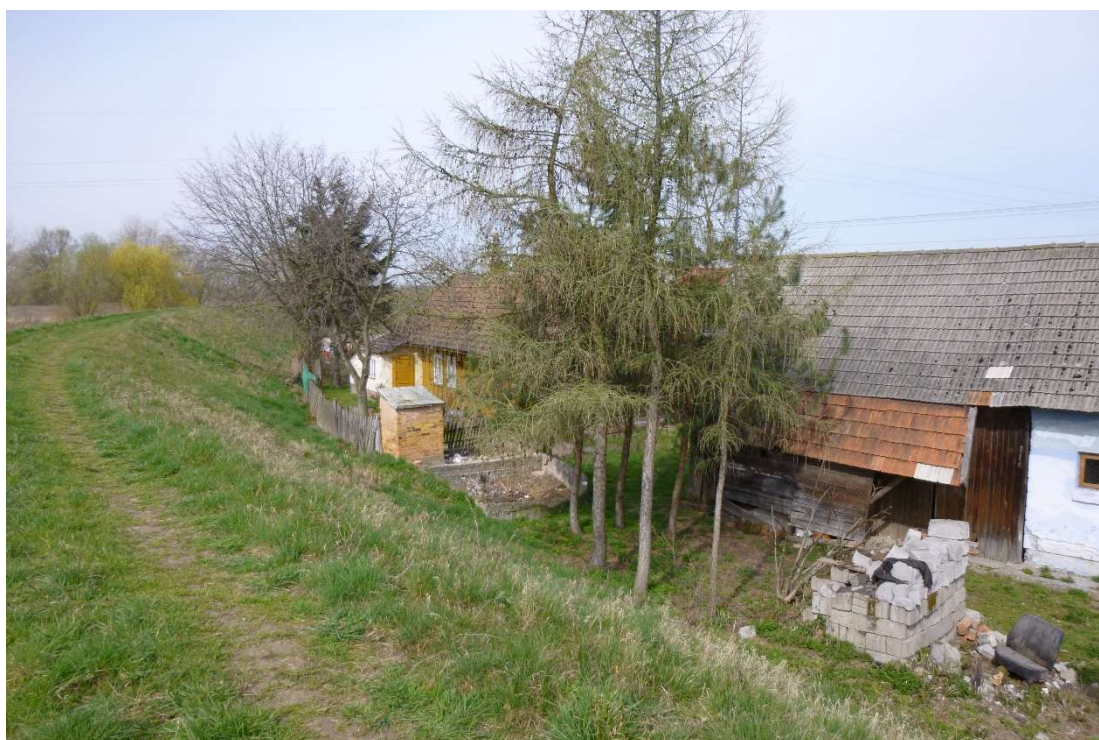
Photo. 4. Condition of the Construction Site before the start of works implementation – right embankment at chainage 2+956 – 3+120 - the outer-embankment zone, buildings about 2.0 m from the embankment.