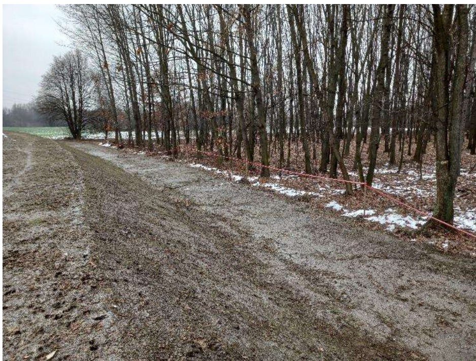
Photo. 13. Left embankment at km approx. 4+500 – condition of fences for trees left outside felling (3rd decade of January 2023).