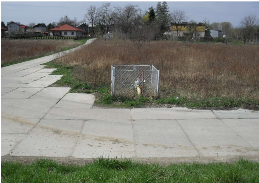
Photo. 3. Condition of the Construction Site before the start of works implementation – left embankment – residential buildings outside the area of works.