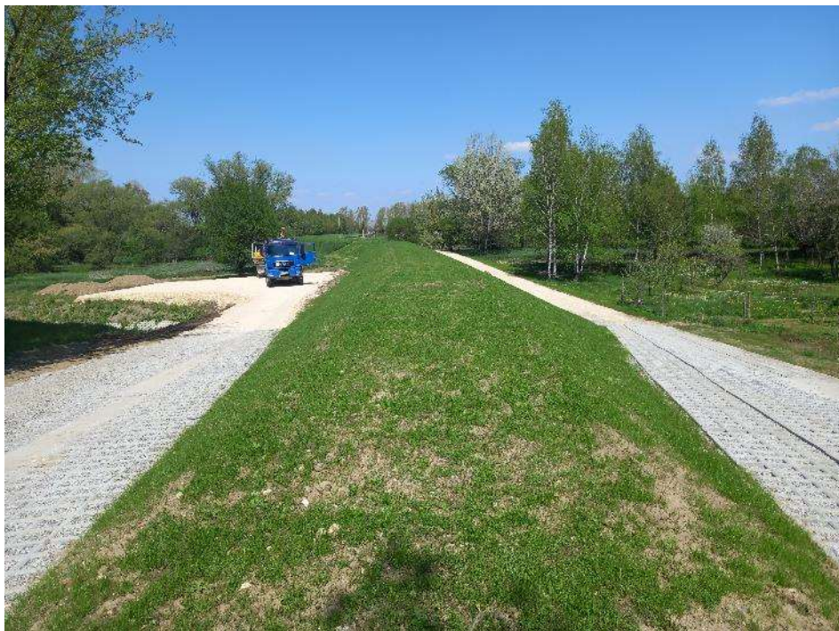
Photo. 21. Right embankment at km approx. 3+150 – site reclamation (3rd decade of April 2023).