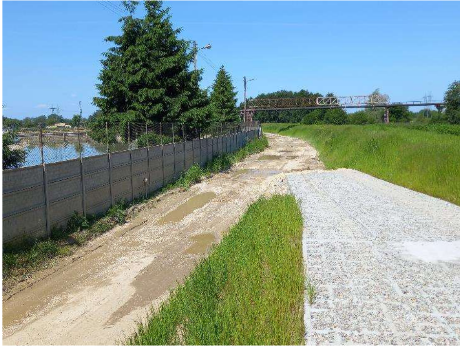
Photo. 22. Left embankment at km approx. 1+000 – site after the completion of works (May 2023).