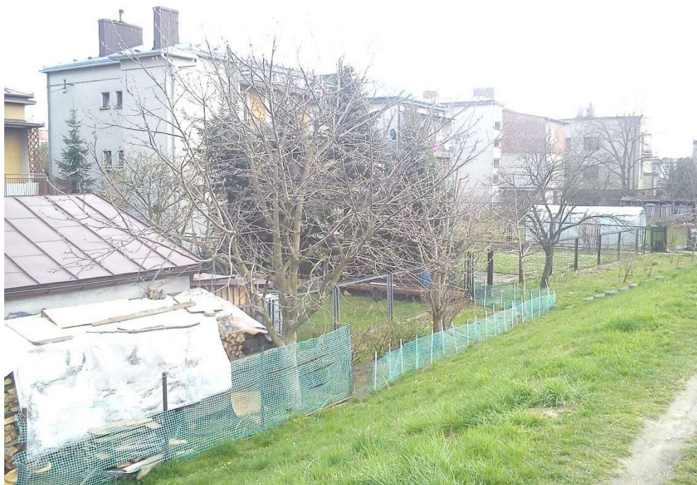
Photo. 5. Condition of the Construction Site before the start of works implementation – right embankment at chainage 5+260 – 5+860 - utility building with a fence.